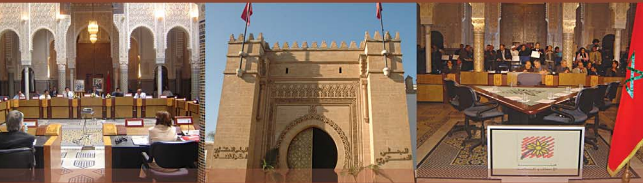
The Human Rights Advisory Council